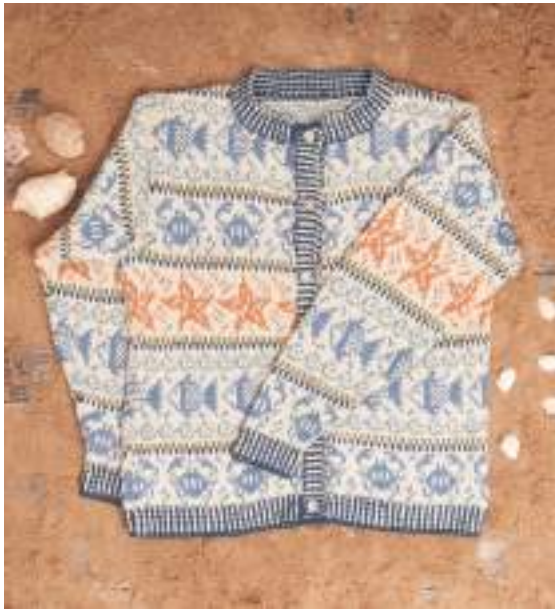
Sample size 11-12 years