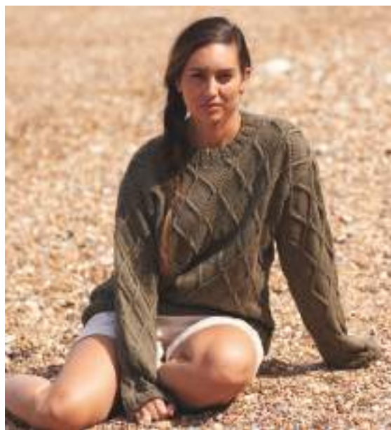
Sample size 102-107 cm (40-42")