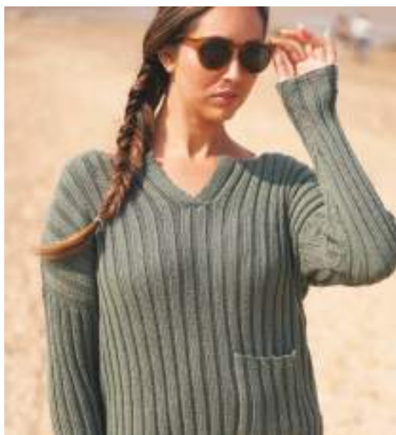
Sample size 91-97 cm (36-38")