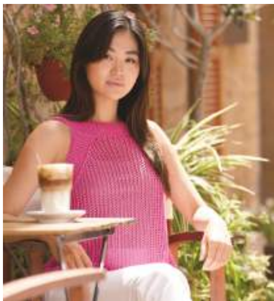
Sample size 81-86 cm (32-34")