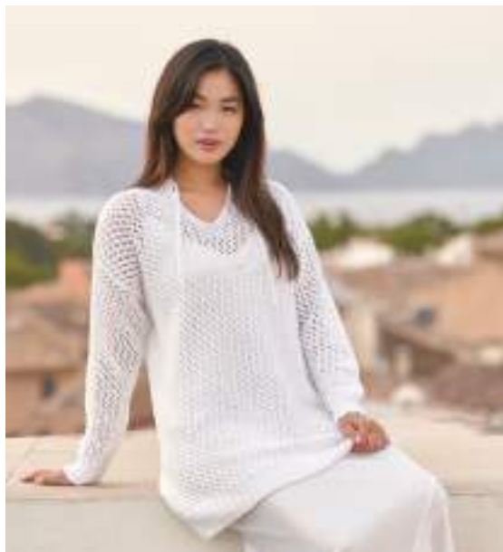
Sample size 81-86 cm (32-34")