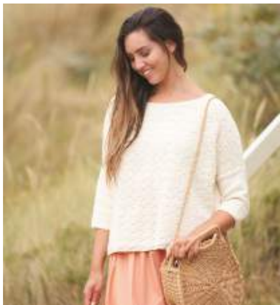
Sample size 91-97 cm (36-38")