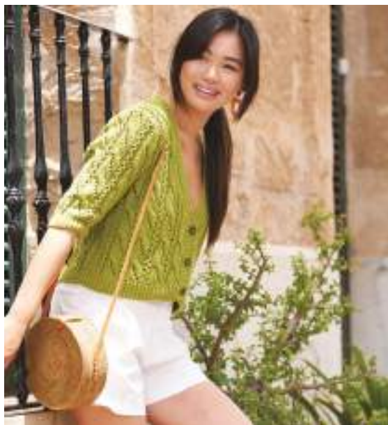
Sample size 81-86 cm (32-34")