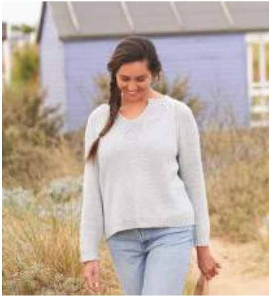
Sample size 91-97 cm (36-38")