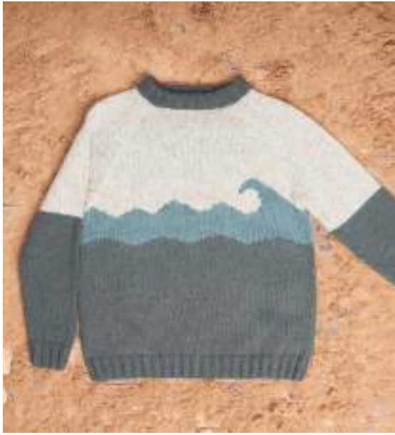
Sample size 7-8 years