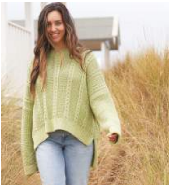
Sample size 91-97 cm (36-38")