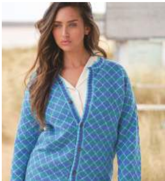
Sample size 102-107 cm (40-42")