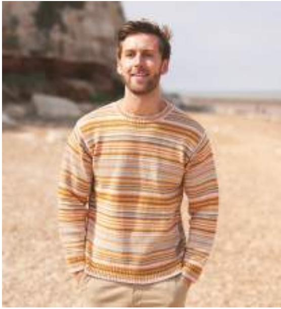
Sample size 102-107 cm (40-42")