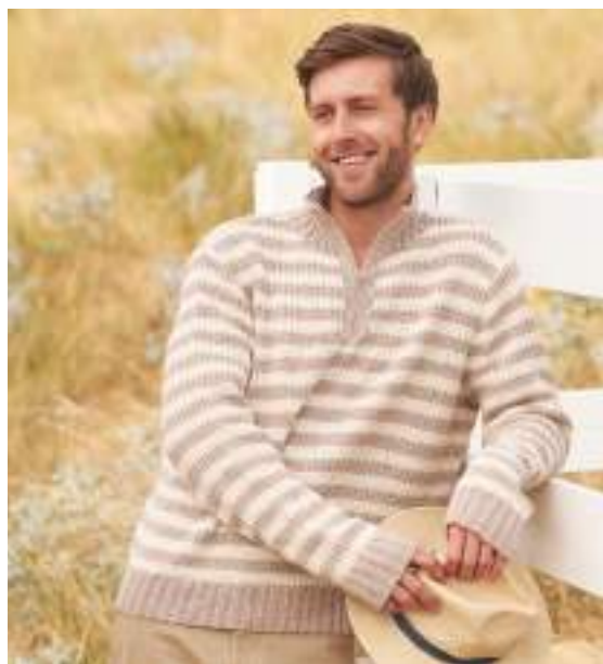
Sample size 102–107 cm (40–42")