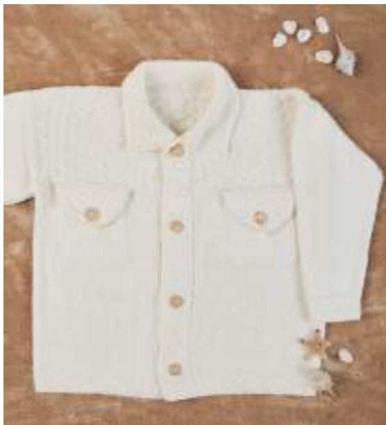
Sample size 7-8 years