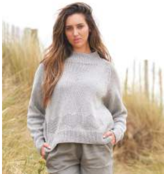
Sample size 91-97 cm (36-38")