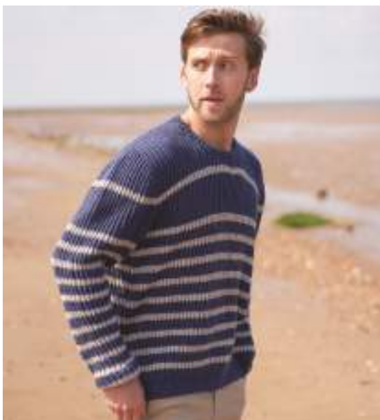
Sample size 102-107 cm (40-42")