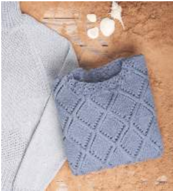
Sample size 11-12 years