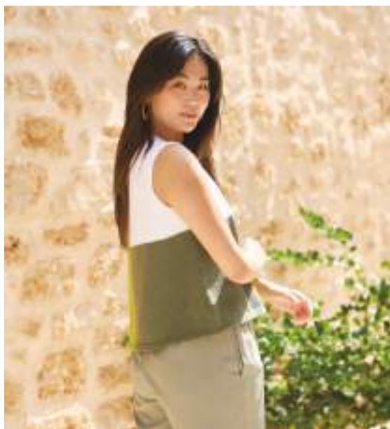
Sample size 81-86 cm (32-34")