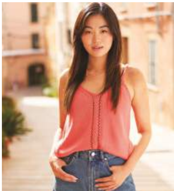
Sample size 81-86 cm (32-34")