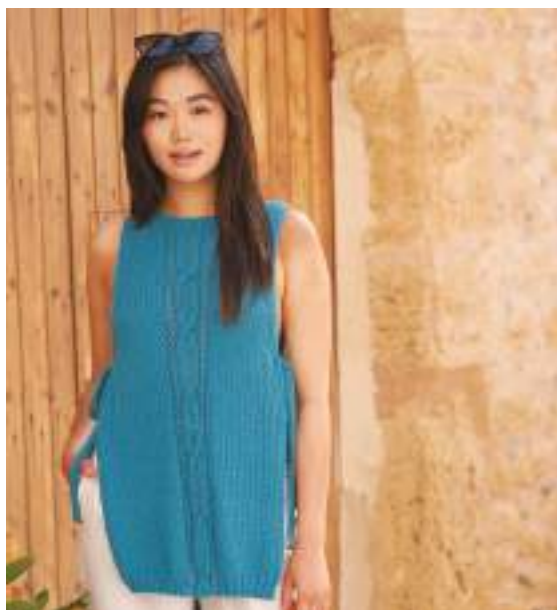
Sample size 81-86 cm (32-34")