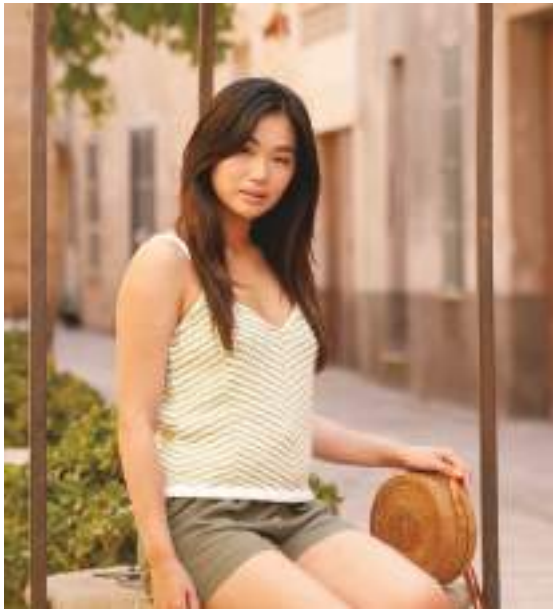
Sample size 81-86 cm (32-34")