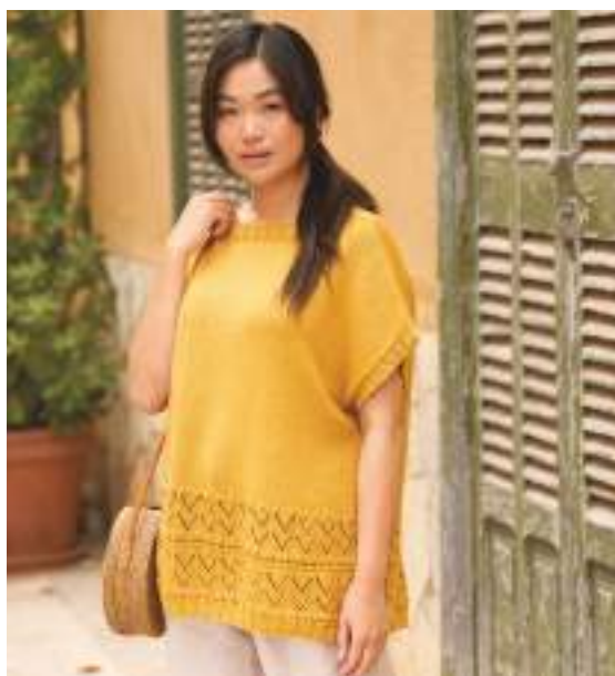
Sample size 81-86 cm (32-34")