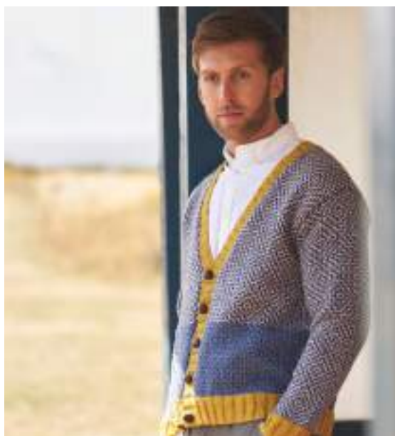
Sample size 102-107 cm (40-42")