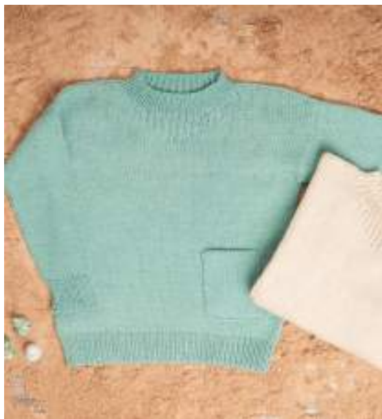
Sample size 7-8 years and 11-12 years