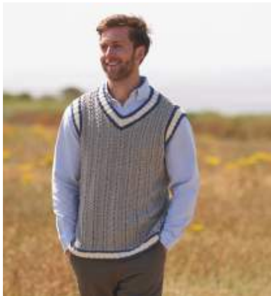
Sample size 102-107 cm (40-42")