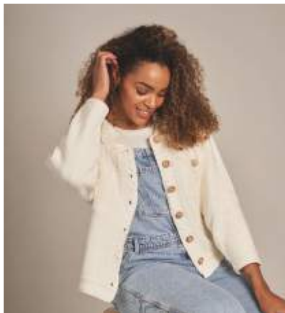
Sample size 32-34" (81-86cm)