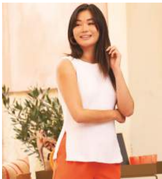
Sample size 81-86 cm (32-34")