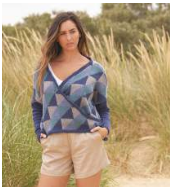
Sample size 91-97 cm (36-38")