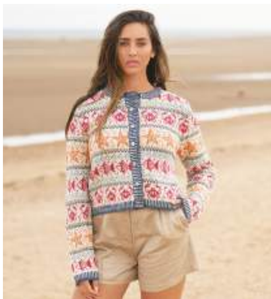
Sample size 91-97 cm (36-38")