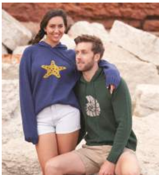
Sample size 102-107 cm (40-42")