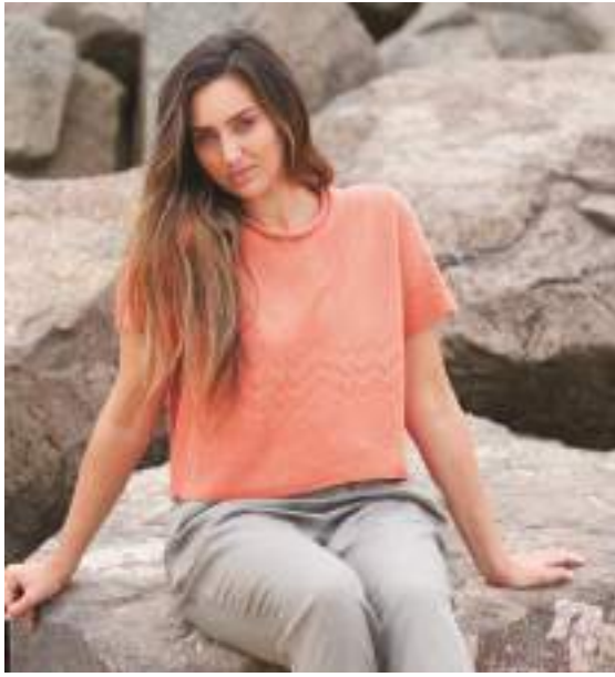
Sample size 91-97 cm (36-38")