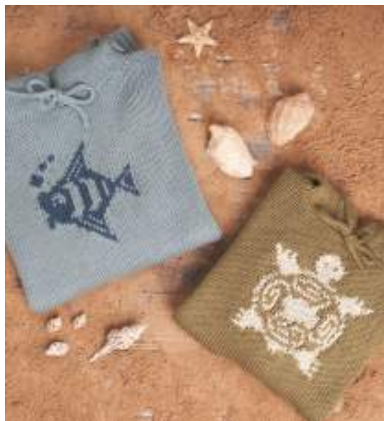
Sample size 7-8 years and 11-12 years