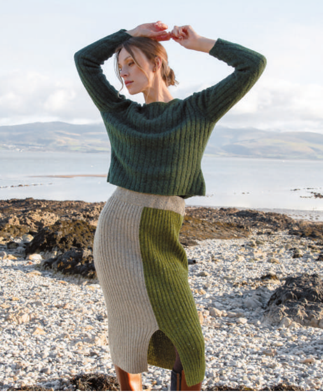
Sample size 86-91 cm (34-36")